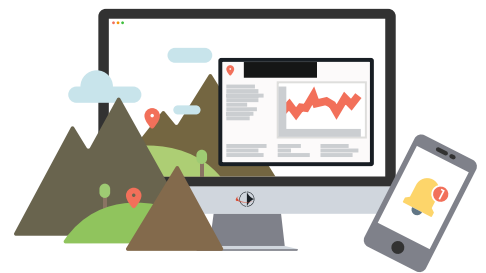
Enjoy your data